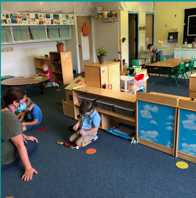
Our preschoolers came back September 10th