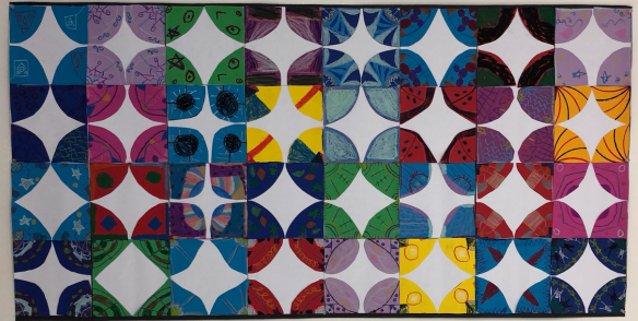
Student artwork displayed outside our Main Office