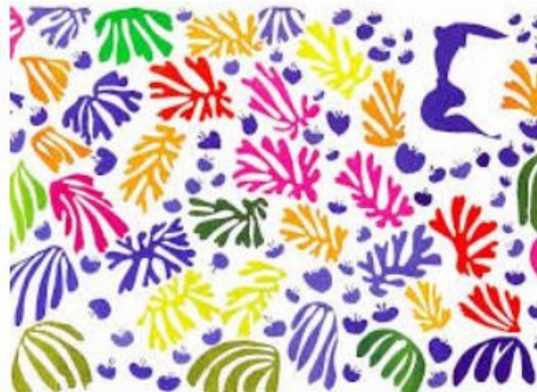
HENRI MATISSE PART OF HIS "CUT-OUTS" SERIES