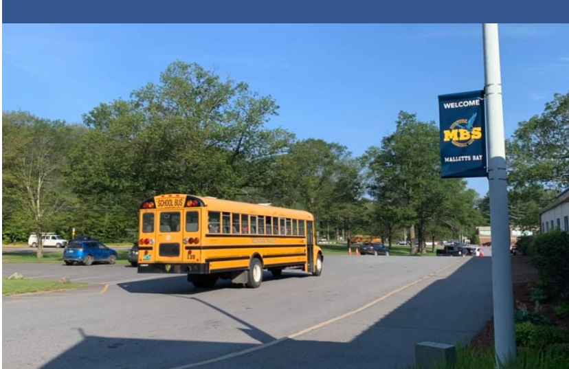
One of the first buses drives by the main entrance on the first day of school!