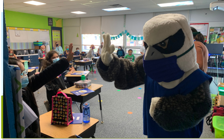
Oscar the Osprey came to visit during Thursday's Schoolwide Celebration!